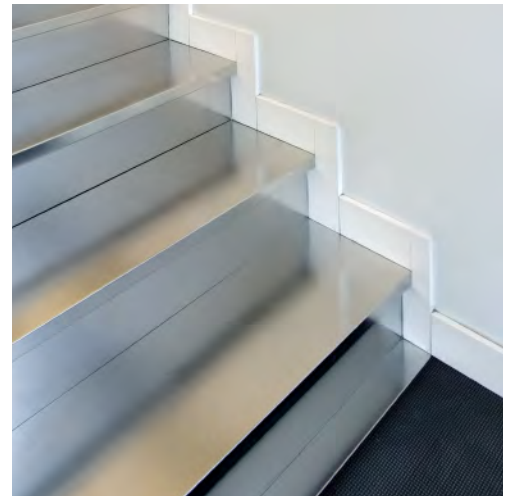
Example of use